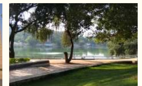
J Vengal Rao Park