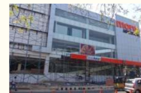
More Mega Store