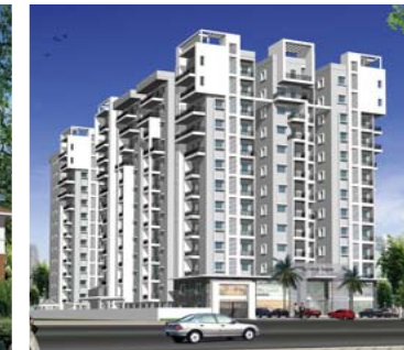
Fortune Heights - Miyapur