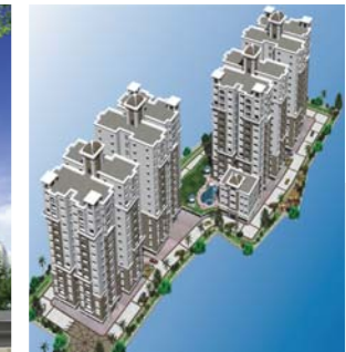
Fortune Towers - Madhapur