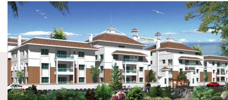
Fortune Enclave - Banjara Hills